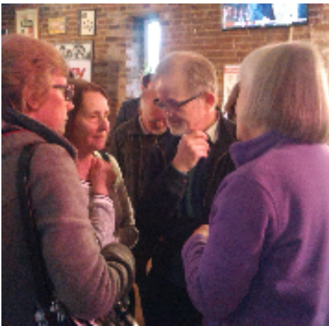
Interested residents at the WEA Exhibition

Awareness - people were keen to find out when facilities would be provided in the area. Of particular concern were the health facilities and capacity and catchment areas of the new schools. Some of these queries were addressed at the WEA Public Exhibition, and we have continued to provide information to the community via email and Facebook when possible. People have also been encouraged to sign up to Growth Gossip for updates, and we have contacted Gallaghers about running some more walking tours as these were particularly popular. We will continue to signpost people to information and will make links with the WEA website once it is up and running.